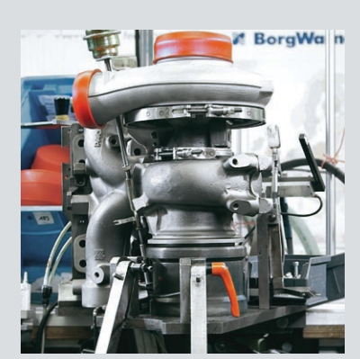
... setting and functional check