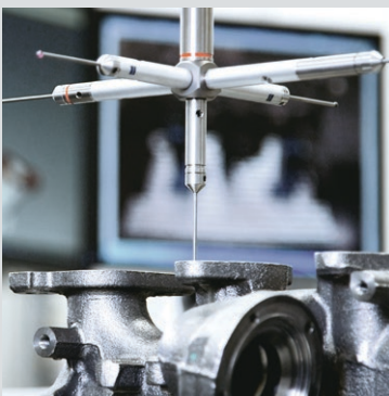
... and quality check