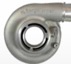
Compressor Cover SX-E Style

See page 37 for: Speed Sensor, Turbine Gaskets & V-Bands, Oil Drain Gasket & Fitting, Actuators & Brackets