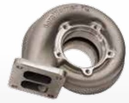
H-Type Turbine Housing