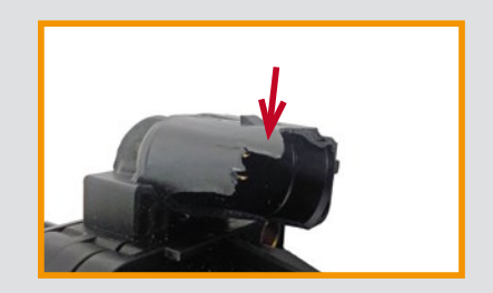
Cracked or damaged plastic parts