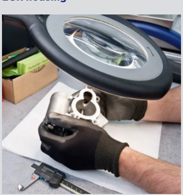
Selection of the individual components prior to final assembly