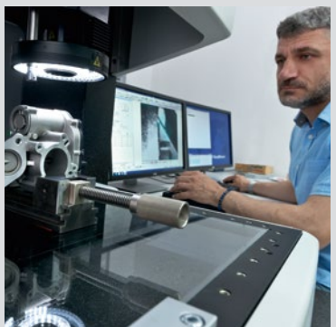
Careful inspection of every single EGR valve